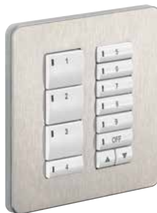
Above: The Revolution series user interface (European model).