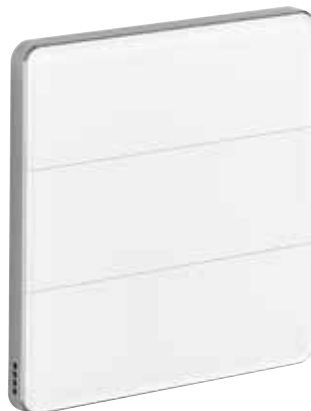
Right: The AntumbraDisplay (North American model).