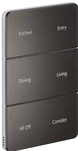
Left: The AntumbraButton (North American model).

We offer a stylish range of user interfaces designed to match all interior design requirements and budgets. Each Antumbra and Revolution user interface can be engraved or labeled with words or icons to explain the function of each button, and this can be rolled out across a hotel network. Refer to the Philips Dynalite User Interfaces brochure for more information on the ranges available.